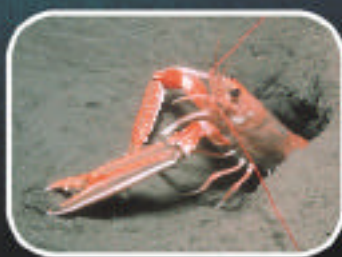
Dublin bay prawn