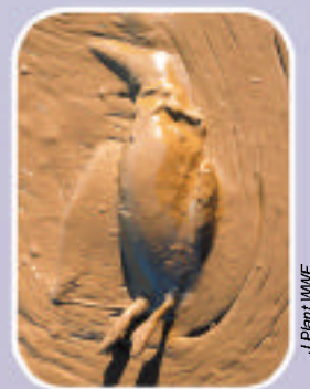
Bird caught in oil spill