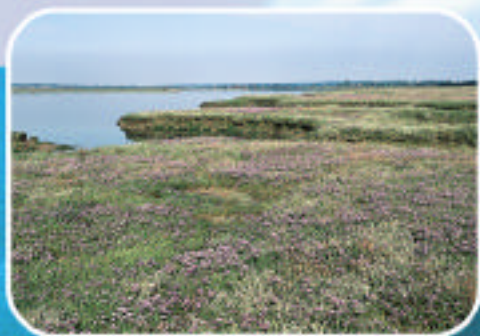
Abbotts Hall Farm showing sea lavender